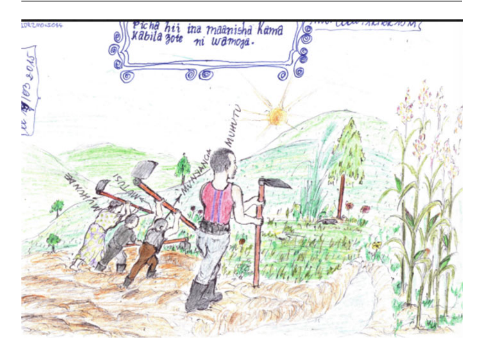
Fig. 1 All tribes are the same. Drawing of people of different tribes, ages, and gender farming together harmoniously, drawn by a 15 year old boy in Kitchanga, DRC. On top is written, "all tribes are the same"

an 18-year-old adolescent from Goma explained. In fact, interethnic marriage was mentioned several times by participants.